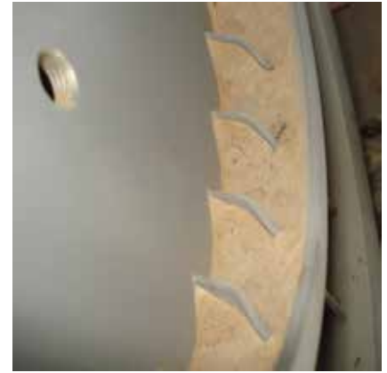
Sand build up in Oil Cooler