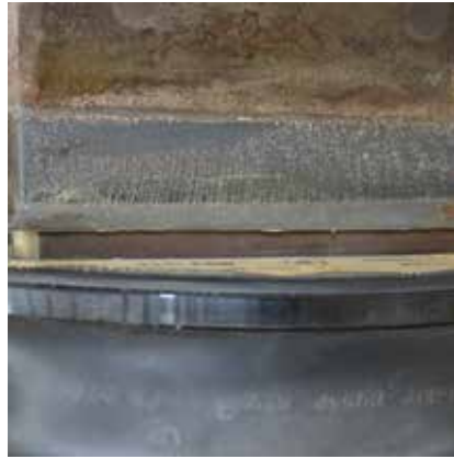
Debonded Tail Rotor Boot Cuff