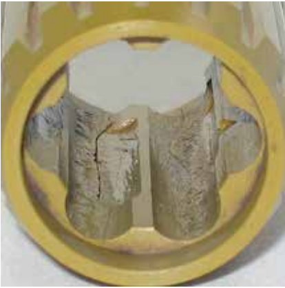
Cracked Spline Adapter