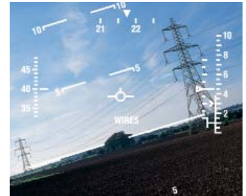
Wires Warning and Cueing