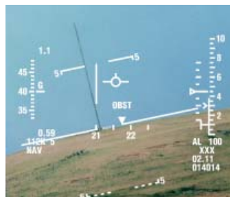
Obstruction Warning and Cueing