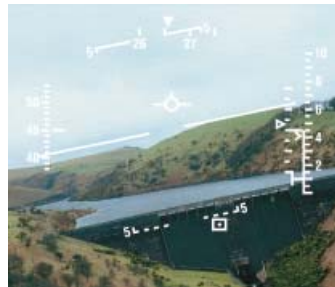
Terrain Referenced Navigation